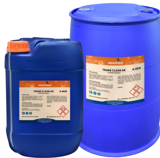
A-4936 TRANS CLEAN AK 25L / 205L