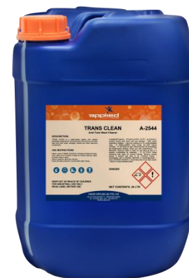
A-2544 TRANS CLEAN 25L / 205L