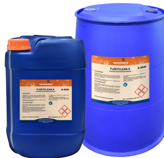
A-4049 FLEETCLEAN A 25L / 205 L