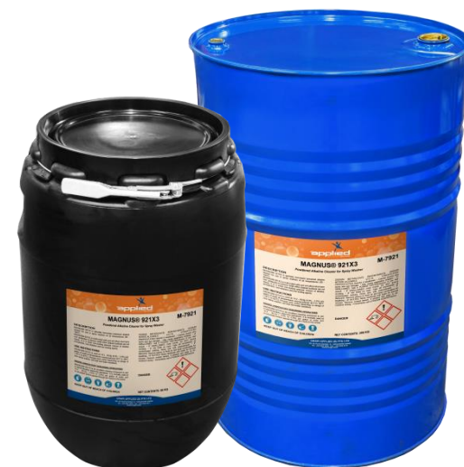
M-7921 MAGNUS 921X3 50kg / 205kg