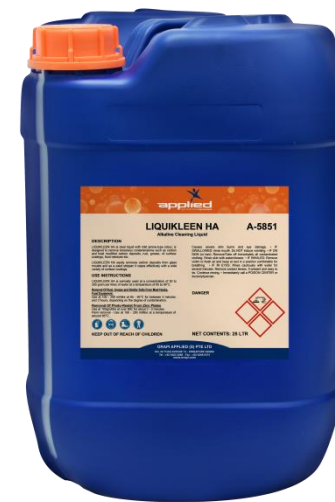
A-5851 LIQUIKLEEN HA 25L